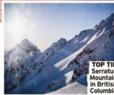
TOP TIP Serratus Mountain in British Columbia

It was accompanied by amazing mountain views and a Caesar – a Canadian cocktail similar to a Bloody Mary but with more spice, clam juice and over-the-top accompaniments ranging from