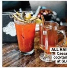
ALL MAIL Caesar cocktails at GLC

“ The names of the runs make you feel like you're exploring a wild frontier ”