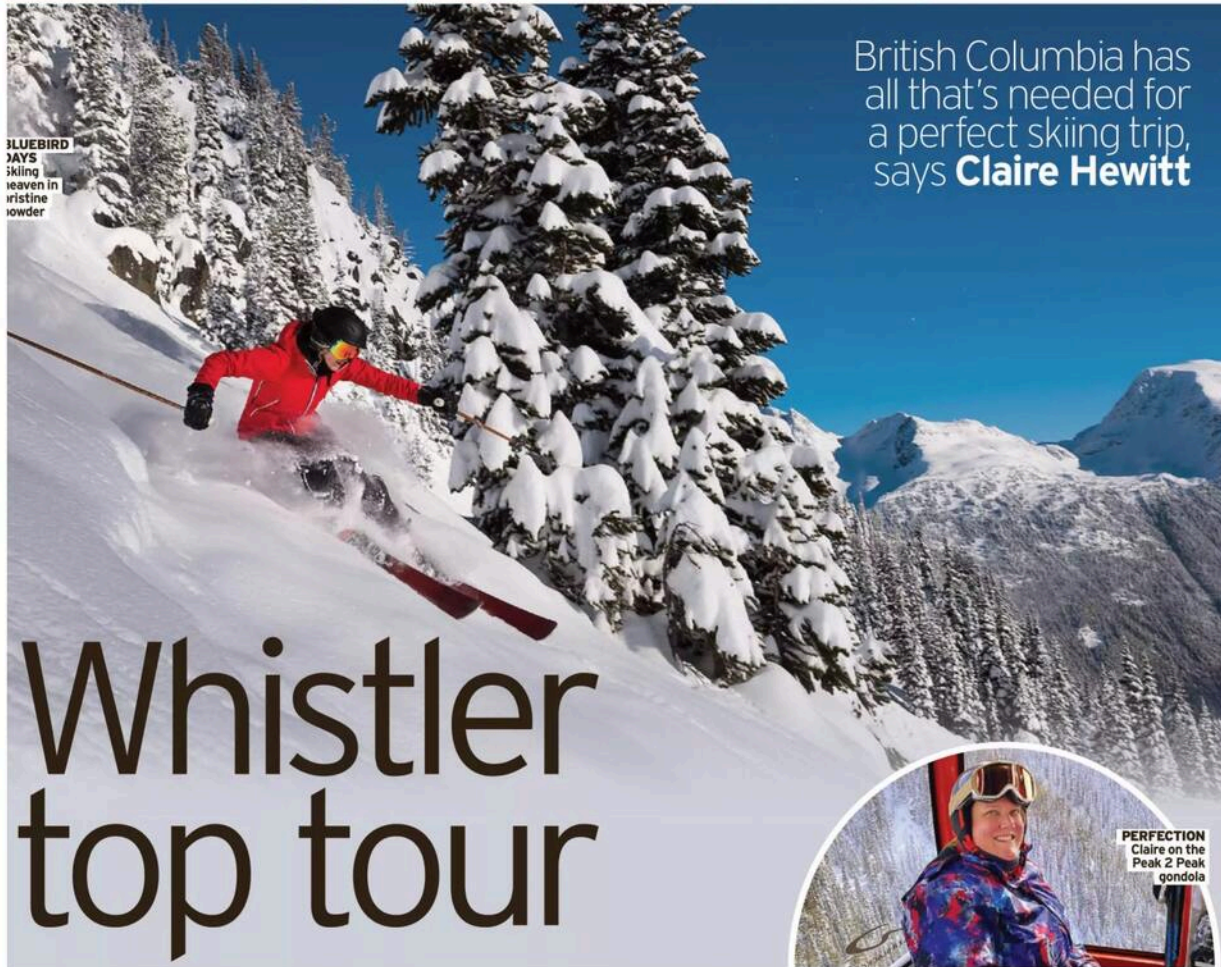
BLUEBIRD JAYS skiing heaven in pristine powder