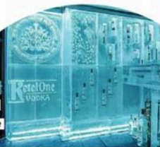
ON ICE Bearfoot Bistro's Ketel One room